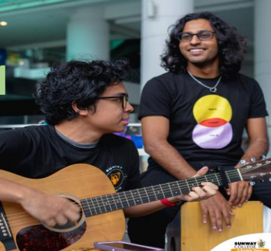
Feb 27-Mac 01 Alumni Engagement Rooftop Terrace 9.00am - 6.00pm

Student Welcome Week (ISWW) GC Observation Deck 4.00pm - 7.00pm