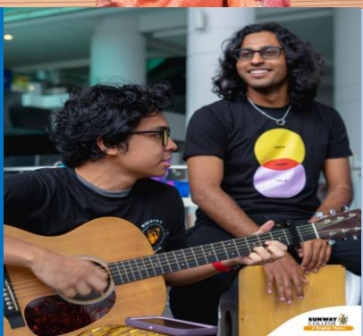
May 02 Student Leaders Gathering Jeffrey Cheah Hall 8.00am - 11.00pm

May 31 Bear - Preciation Day Observation Deck 5.30pm - 7.00pm