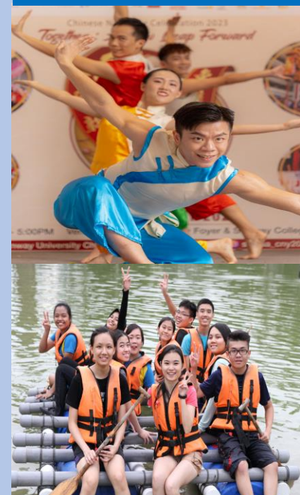
June 01 After Hours Jeffrey Cheah Hall 8.00am - 11.00pm

May 31 Bear - Preciation Day Observation Deck 5.30pm - 7.00pm