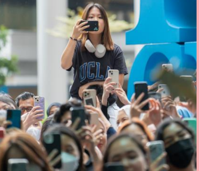
Apr 23-25 Riang Ria Raya C&S Carnival University Foyer 10.00am - 4.00pm