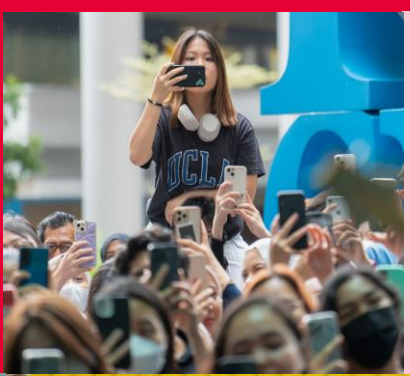
Sept 21 The Lost Quest Sunway Campus 9.00am - 6.00pm