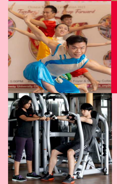
Oct 05 Sunway Alumni Homecoming Sir Jeffrey Cheah Hall 5.00pm - 10.00pm