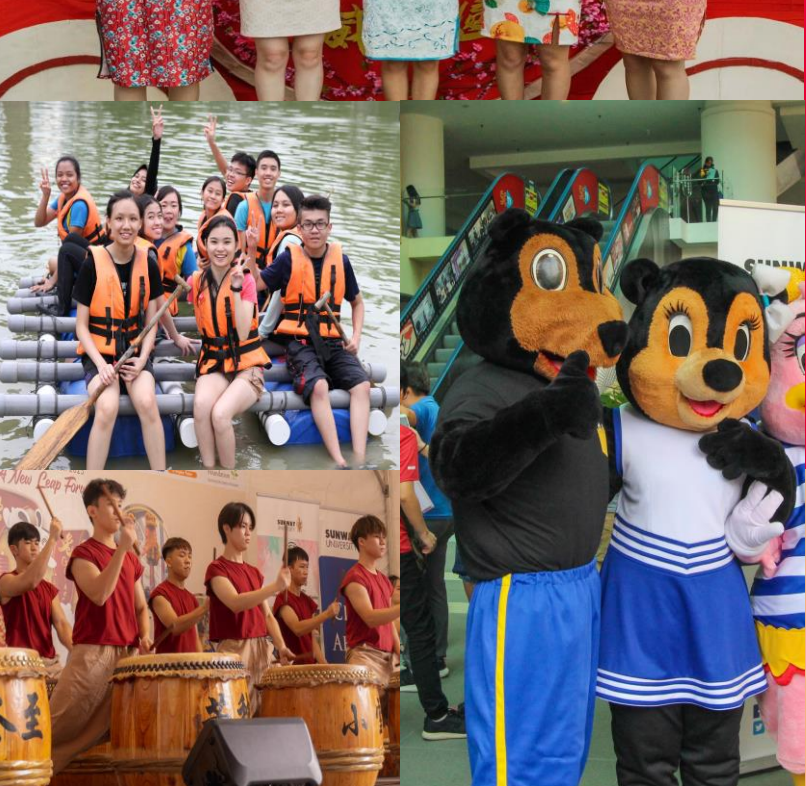
Oct 15 Friendship Month: Viva La Friendship Art Gallery 6.00pm - 8.00pm