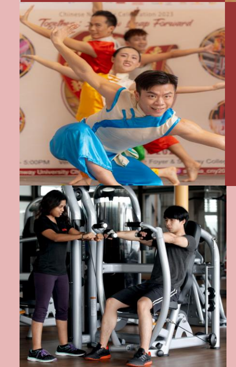
Oct 05 Sunway Alumni Homecoming Sir Jeffrey Cheah Hall 5.00pm - 10.00pm