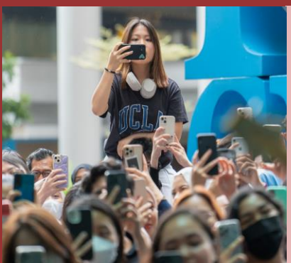
Sept 21 The Lost Quest Sunway Campus 9.00am - 6.00pm