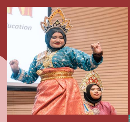
Sept 18-21 International Student Welcome Week (ISWW) Jeffrey Cheah Hall 6.30pm - 8.30pm