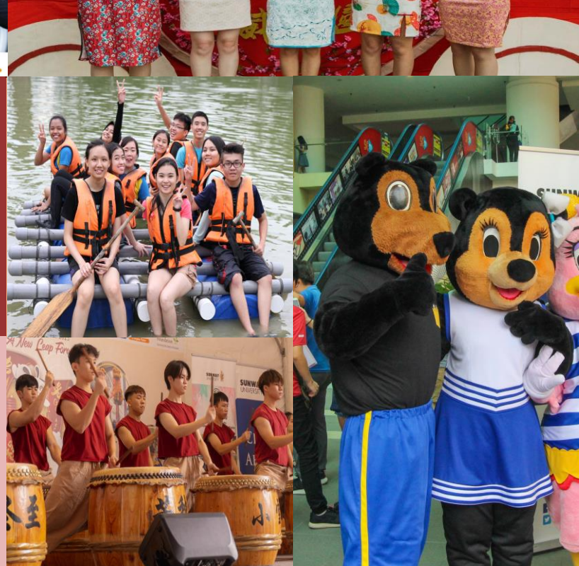
Oct 15 Friendship Month: Viva La Friendship Art Gallery 6.00pm - 8.00pm