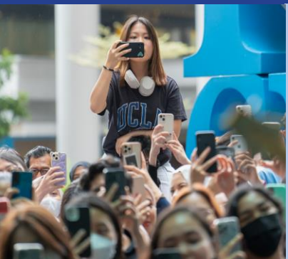
Sept 21 The Lost Quest Sunway Campus 9.00am - 6.00pm