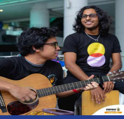
Oct 02-05 CPA Roadshow University Foyer 8.00am - 5.00pm